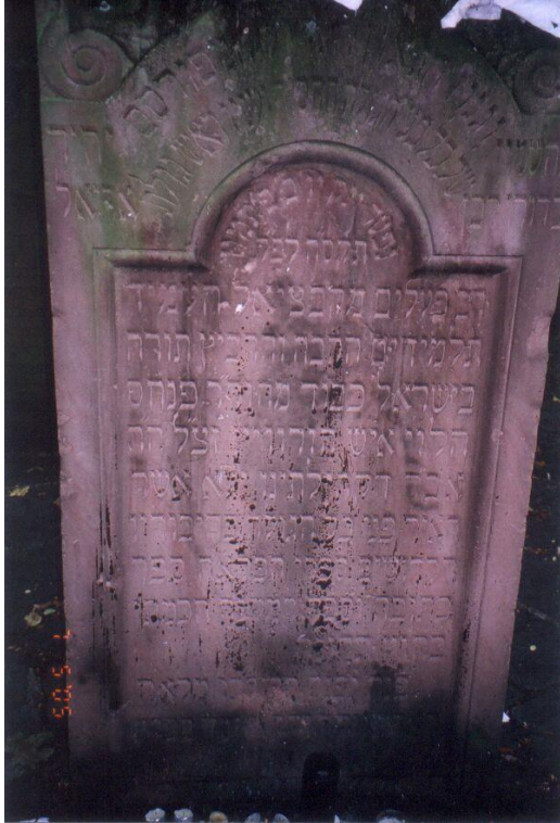
Rabbi Pinchas Horowitz

Slowly I was coming to the dear graves. There were many candles, notes, just like at the Western Wall in Jerusalem. The inscriptions on the tombstones were partly faded, but nevertheless I managed to read the words of sorrow and gratitude of the Jews whom they taught and led.