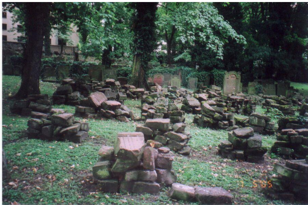
The Old Jewish Cemetery in Frankfurt

Very close to the museum is the Old Jewish cemetery, the most of its tombstones were destroyed by the Nazis in their crazy war against the Jews, live and dead. The fragments of the tombstones are laid in small piles and one big pile, the evidences of the 20 th century barbarity. The big part of the survived tombstones are situated along the cemetery's wall or in the group at its far part, opposite from the gate. A small number of tombstones are organized into a special group – these are the matzevot of prominent residents of Frankfurt. Matzeva of R., the author of "Pnei Yehoshua" is there as well as he tombstones of the Rotschild Family members. Here are also the tombstones of R. Pinchas and his son R. Zvi Hirsh, for them I actually came to Frankfurt.