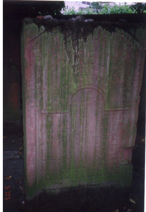
Rabbi Zvi Hirssh Horowitz

The hands of my watch were unmercifully moving ahead, the museum's closing hour was getting nearer and nearer. Trembling, I locked the heavy iron gate and gave the last glance to the Cube, tolling between young maple trees, assembled with the fragments of the ruined synagogue, and turned to the train station.