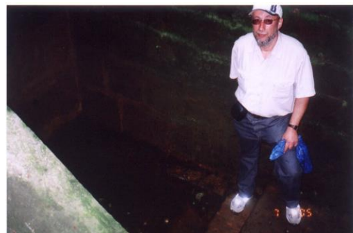
Cologne: the Old Mikveh

An intercity express was rushing at 250 km/h to Munich, the last point of my trip. The car I was sitting in was full of Turks, Asians, Arabs. It was new Germany, multinational and open. "But will it be so in the long run", I was asking myself, "or it will be only a short period of tolerance which in a period of economical or political strife will be wiped with a wave of hatred and xenophobia, as it just happened there many times in the Past?"